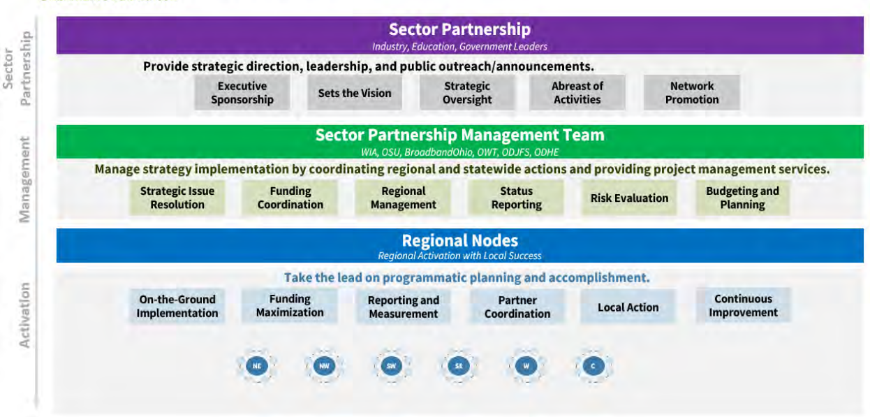
Figure 3. Governance framework for "Strengthening Ohio's Broadband and 5G Workforce Strategy"

Specifically, the Strategy has developed three key partnerships that form the Strategy's governance structure: (i) the Broadband and 5G Sector Partnership ("Sector Partnership"), (ii) the Sector Partnership Management Team, and (iii) six regional hubs ("nodes"). Additionally, the Strategy supports partnerships with industry players to develop and expand training programs that equip the workforce with relevant skills via pre-apprenticeship and apprenticeship programs.